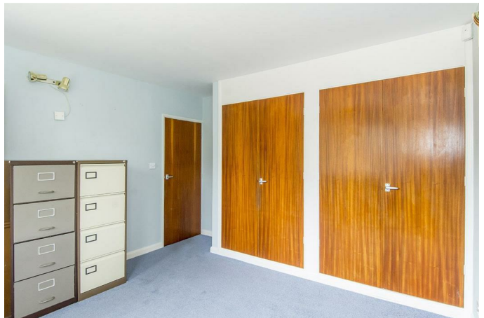
Bedroom Two Photo Two

A double bedroom with a window to the front aspect, built-in wardrobes and a radiator.