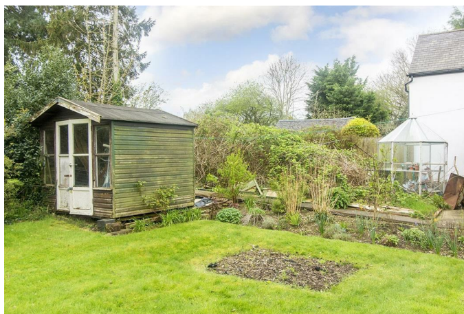
Garden Photo Two

The private south facing garden has wonderful field views and is mainly laid to lawn with well stocked shrub borders and mature trees. There is a large paved patio seating area, outside tap, garden shed and a greenhouse. Gated side access.