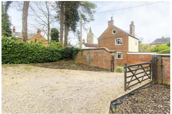
Outside & Parking

The frontage is walled and has a timber five bar gate that opens into the gravel drive which provides ample off road parking. There is a further paved area to the side that leads to the garage and gated access to the garden.