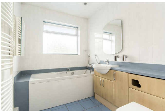
Bathroom 6'00 x 6'00 (1.83m x 1.83m)

Fitted with a modern suite comprising back to wall WC, wash hand basin set onto a vanity unit, bath with mixer taps & shower attachment, heated towel rail, ceramic wall & floor tiles, opaque window to the front aspect.