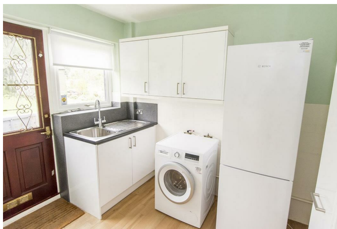
Utility Room 9'11 x 6'10 (3.02m x 2.08m)

Fitted with wall units, stainless steel sink unit with mixer taps, space for a washing machine & tumble dryer, wall mounted Worcester Bosch gas central heating boiler, wood effect laminate flooring, window to the rear aspect and a back door gives access to the outside.