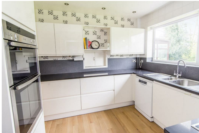
Kitchen 9'10 x 9'10 (3.00m x 3.00m)

With a window overlooking the garden the kitchen is fitted with a range of modern gloss cabinets with granite surfaces, Neff built-in double oven, electric ceramic hob with extractor, stainless steel bowl and half sink unit with mixer taps, wood effect laminate flooring and space for a dishwasher.