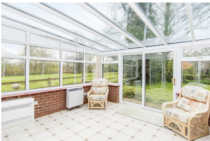
Conservatory 12'04 x 13'00 (3.76m x 3.96m)

With wonderful views over the garden this lovely conservatory has a glass roof, electric wall heater, air conditioning unit, ceramic floor tiles and a set of sliding patio doors open into the garden.