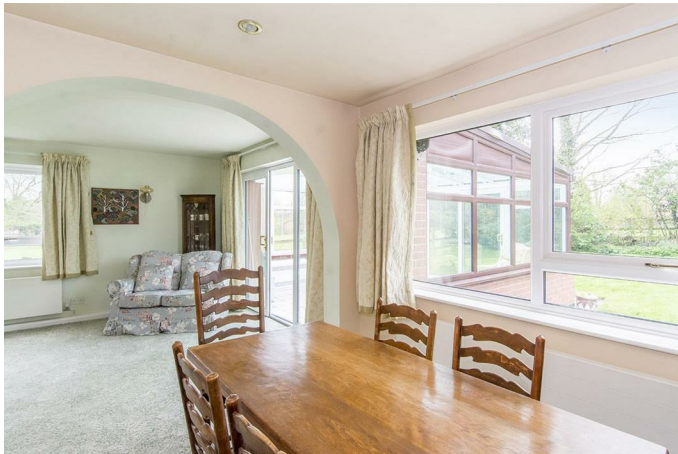
Dining Room 9'11 x 9'00 (3.02m x 2.74m)

The dining room has a window overlooking the garden and a radiator.