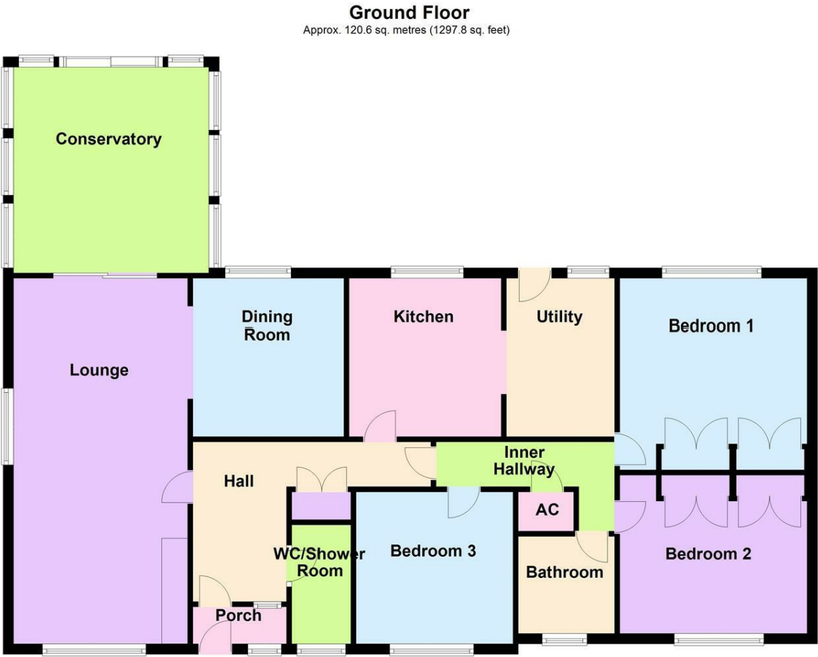
Total area: approx. 120.6 sq. metres (1297.8 sq. feet)