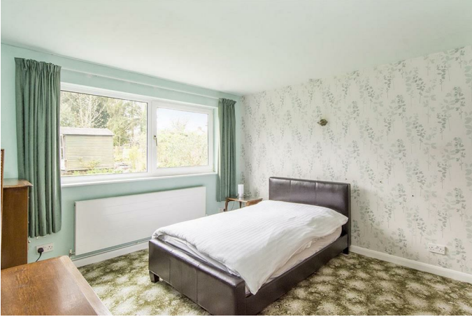
Bedroom One 11'11 x 11'06 (3.63m x 3.51m)

A double bedroom with a window overlooking the garden, built-in wardrobes and a radiator.